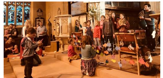
All Age Worship

Training sessions are being put in place for AV so that the team can familiarise itself with new technology and address any other organisational issues that will help the operation of sound and vision.