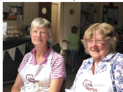
Love Weston Cafe

Love Weston Café The café continued to take place at the Moravian Church Hall every Friday from 9.00am to 3.00pm. It remains very popular, with many customers every week, and is a key part of the local community. It is staffed by volunteers drawn from the three churches and the community.